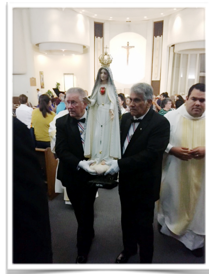
Left photo: Members of the St. Michael the Archangel Color Corps align themselves on either side of the statue of Our Lady of Fatima.